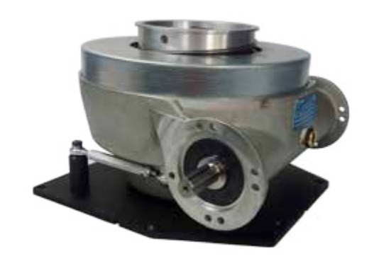
Spiralift HD6 // View 01