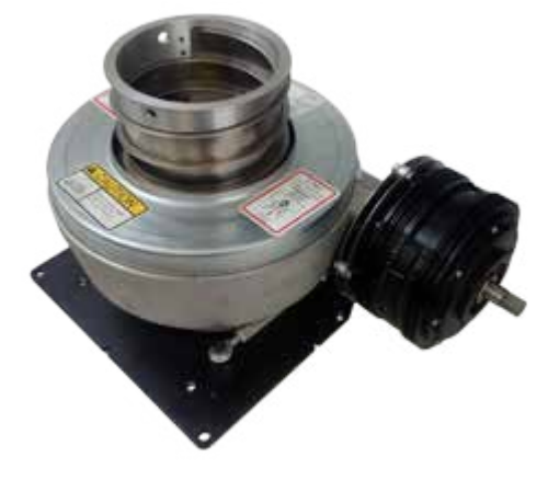
Spiralift HD6 // View 02